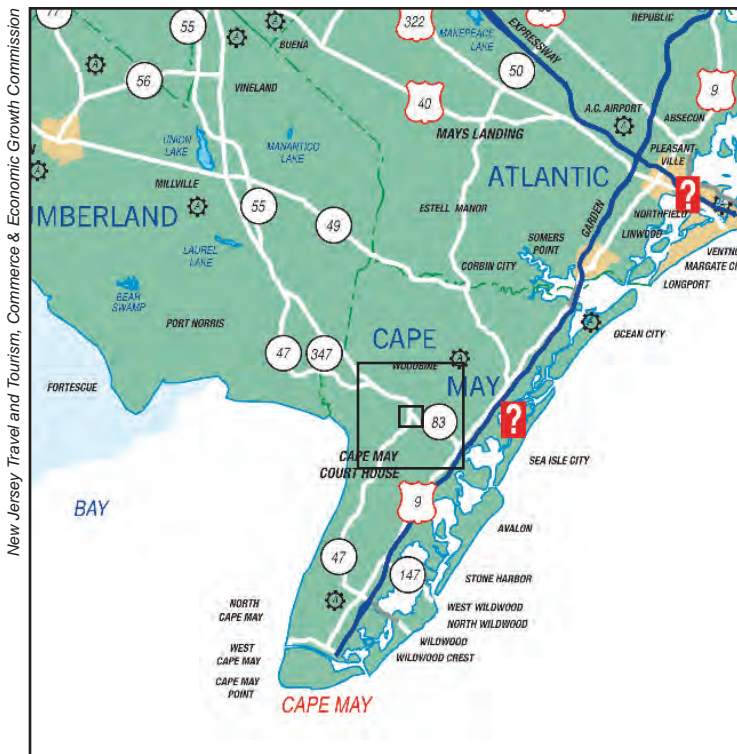
Project vicinity map

Additional information on transportation projects and historic preservation is available from the Division of Environmental Resources, New Jersey Department of Transportation ( http://www.state.nj.us/transportation/works/environment/overview.htm ), the Federal Highway Administration ( http://www.fhwa.dot.gov/environment/archaeology/index.htm ), the New Jersey Historic Preservation Office ( http://www.state.nj.us/dep/hpo/2protection/njrreview.htm ), and the Advisory Council on Historic Preservation ( http://www.achp.gov/work106.html ).