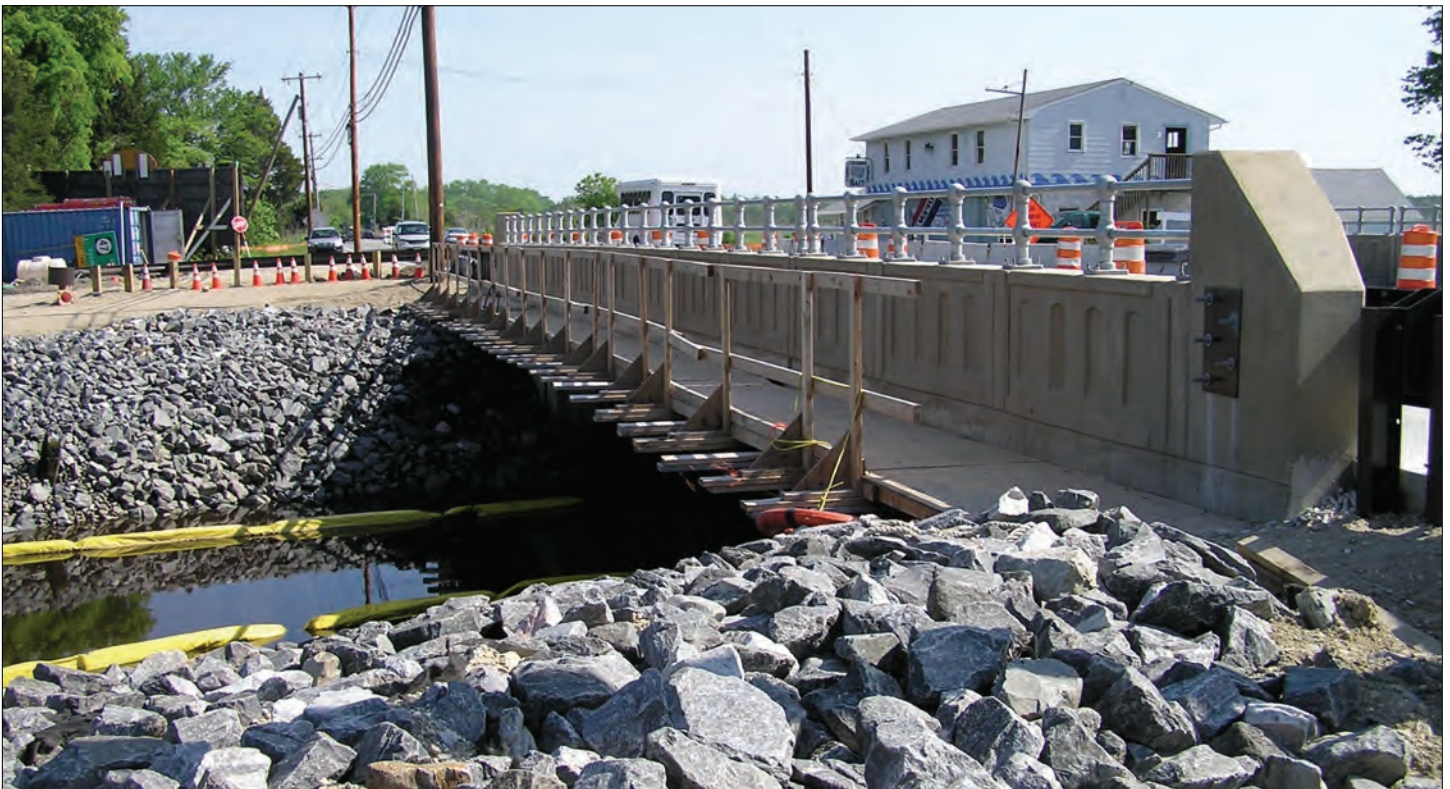
View looking north showing the new bridge near completion in May 2007.

Successful monitoring is integrated into the larger transportation project early in the development of contract documents. The responsibilities of the monitor, contractor, and resident engineer are spelled out in the construction specifications, along with the procedures to be followed by each party. Monitoring locations are written into the specifications and shown on the plans, and provision is also made for unanticipated discoveries in other locations.