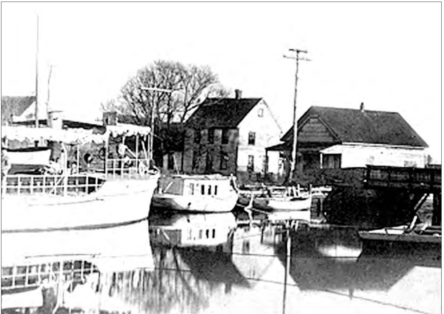
Dennis Creek Landing about 1915. The wooden bridge over Dennis Creek, at right, was built in 1885 and replaced in 1908.

When the current bridge replacement project was in the early planning stages in 2000, an archaeological and historical study of the landing and vicinity was conducted to determine what buried remains—if any—of the once-bustling community survived (see Dennis Creek Landing: A Hub of 19th-Century Maritime Commerce [July 2005], another in the Cultural Resources Digest series). However, traditional archaeological testing is virtually impossible in a tidal marsh without extensive coffer dams and pumping, so the study instead relied on archival research, visual inspection and mapping of visible remains. Besides what was known from historical documents, some wooden timbers and planks could be seen in the creek bed, some only tantalizingly visible at low tide. Wood is known to decay very slowly if it is completely waterlogged and no oxygen is present (a condition called anaerobic ), as is the case if it is buried in muck; in fact, the mining of ancient cedar logs from the bottom of the swamps near Dennisville was one of the region's early industries. For this reason, the study