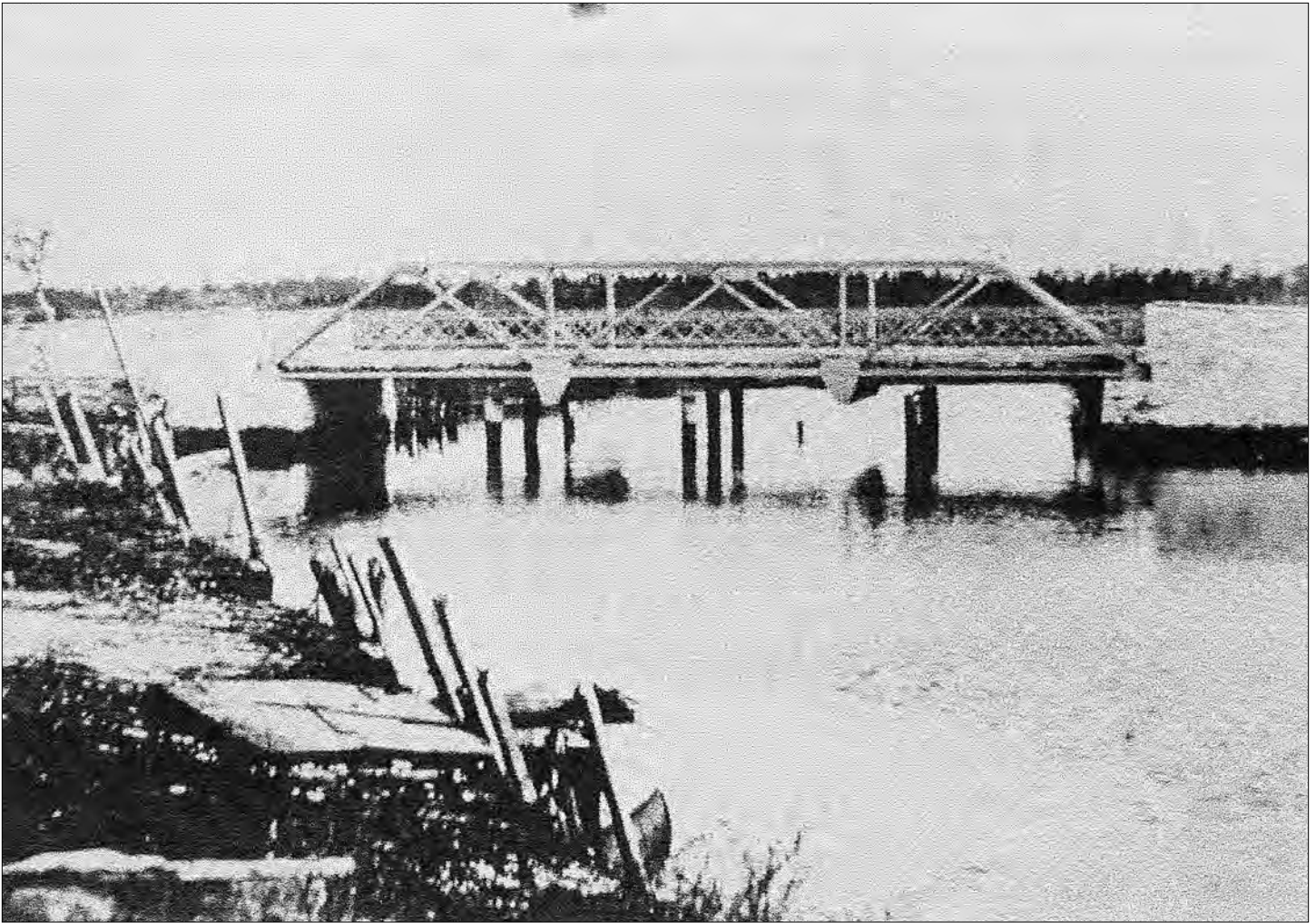
The pony truss bridge over Dennis Creek at Dennis Creek Landing about 1925. This bridge was built in 1908 and replaced in 1928.

in 2000 concluded there was a strong potential that significant archaeological resources were present within the project “footprint” even without subsurface testing. Thus, archaeological monitoring (see sidebar) during construction was recommended as an alternative to a typical archaeological excavation before construction began.