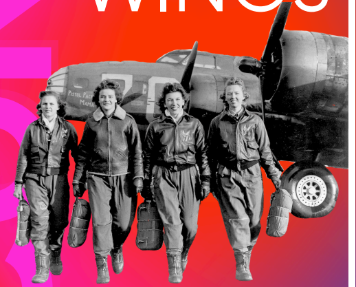
WOMEN AIRFORCE SERVICE PILOTS