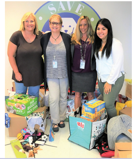
Above: NJDOT employees amongst some of the pet food, toys and other items donated to the SAVE Animal Shelter.

As many of you may know, I have a love of furry friends. NJDOT also included animals in need to our Commitment to Communities mission this summer with a well-received “Pet Drive”. We collected 787 donated items and delivered them to SAVE Animal Shelter in Princeton.