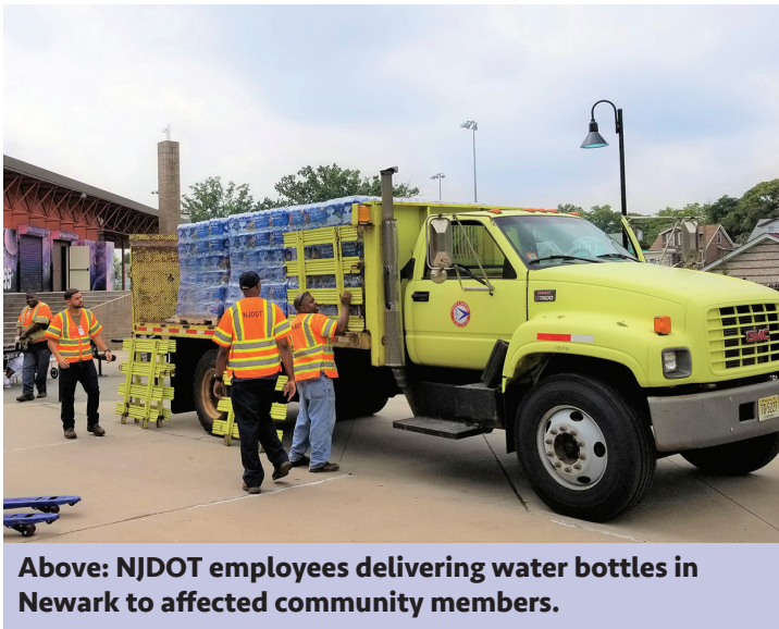
Above: NJDOT employees delivering water bottles in Newark to affected community members.

Two weeks ago, we had the opportunity to lend a helping hand and assist the city of Newark and the Newark Office of Emergency Management by delivering over 48,000 bottles of water to local residents effected by elevated lead levels in their water supply.