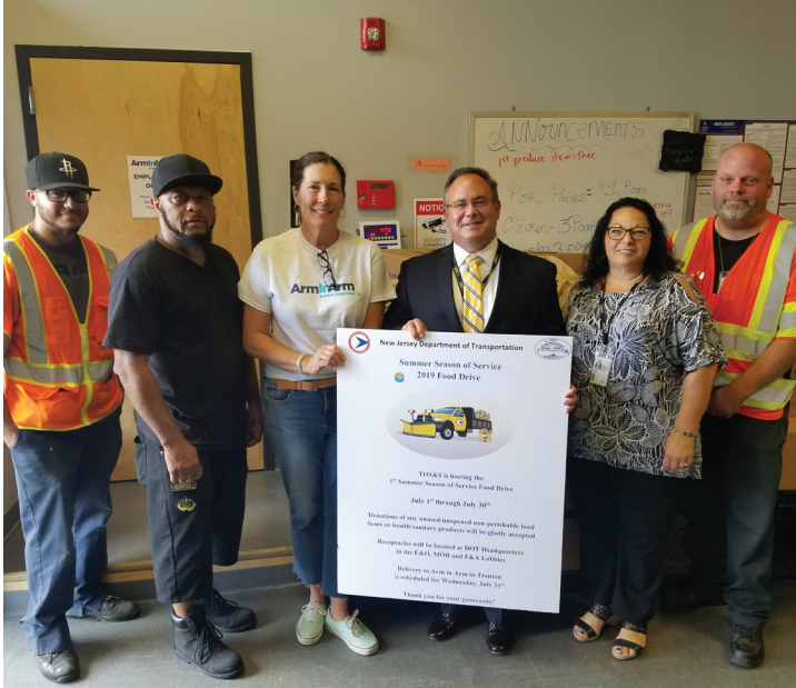
Above: Nearly 500 pounds of food and other items donated by NJDOT staff were delivered to the Arm in Arm community support facility in Trenton during the 1st Summer Season of Service drive.

Additionally, the NJDOT kicked off our first “Summer Season of Service” with a food drive. Employees spent the month of July collecting non-perishable food items to contribute. At the end of the month, we collected more than 611 items and donated them to Arm In Arm, a nonprofit organization that assists thousands of struggling families each year in Mercer County.