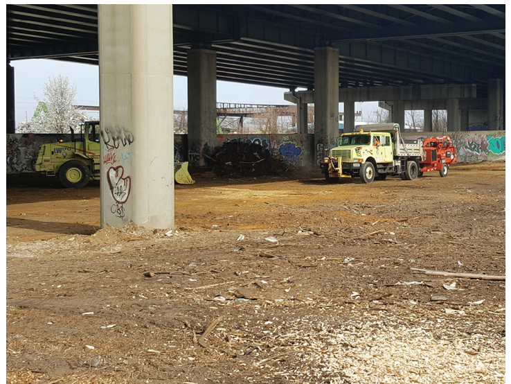
Cleanup under I-676 in Camden.