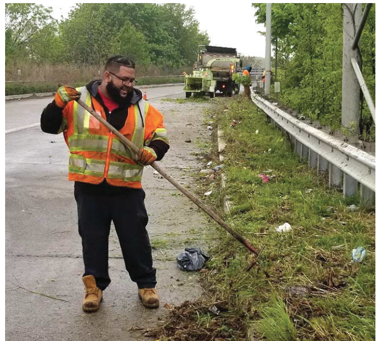
Ramp cleanup on I-78, Newark.