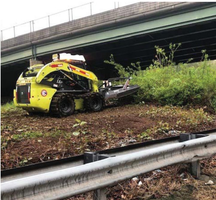
Foliage removal I-78, Newark.