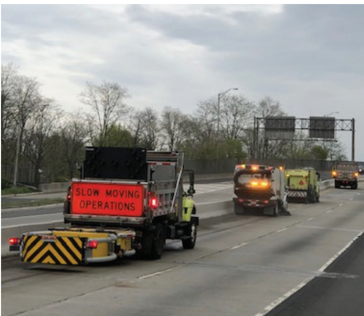
Sweepers on Route 440, Jersey City.