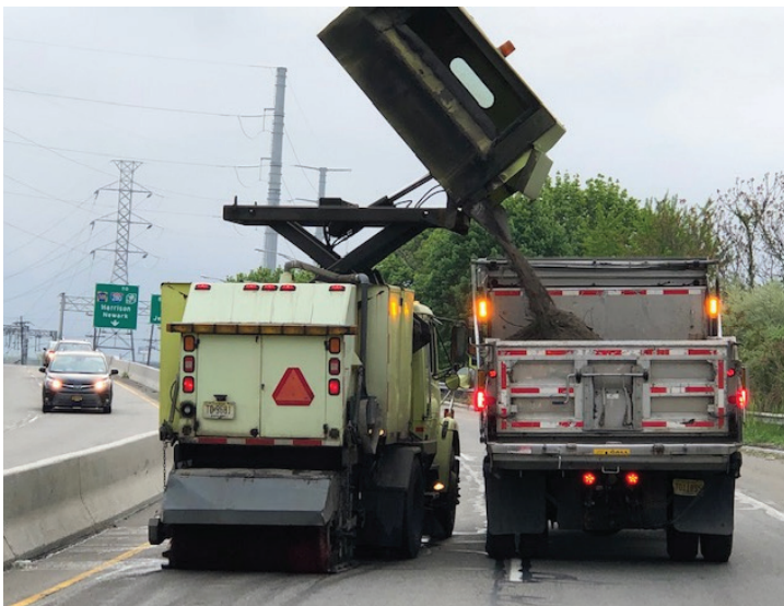
Sweeping operations along I-280, Newark.